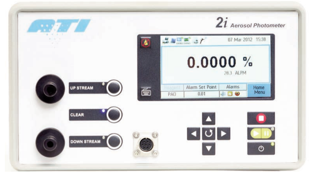
2i Base Display

Routine preventative maintenance entails cleaning and inspection of internal sample tubing and connections, the internal reference filter, and iProbe .