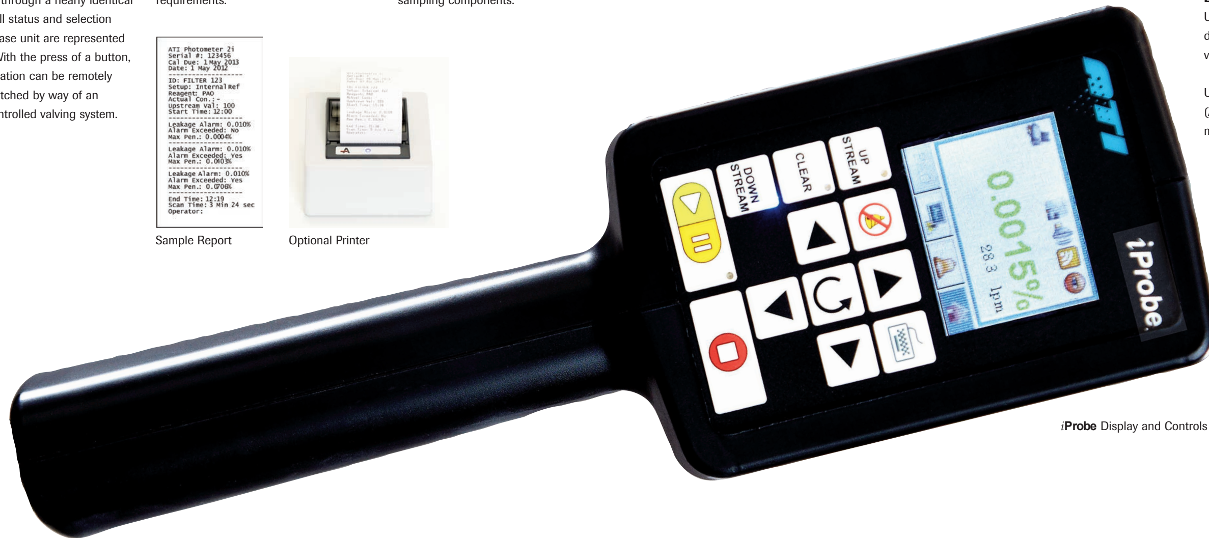
iProbe Display and Controls

User settable Aerosol Noise Suppression (ANS) allows for more stable aerosol measurements when poor mixing is present.